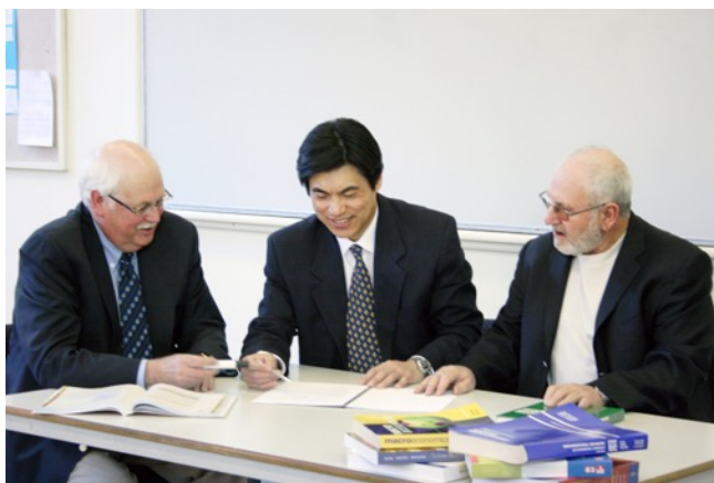
Acelin Senior Management Committee

Accordingly, Acelin's international team of teaching staff has a wealth of international and multicultural experience. They are also competent educators and trainers, having been consistently rated highly over many years by local and overseas participants. They are supported by an experienced senior management group, with extensive experience in international education and training at the highest levels. This includes over fifteen years of direct involvement in the Greater China region. At the operational level, participants are further supported by a team of dedicated professional program managers for each intake of each program, providing a personalized 'one-stop' service of the highest standard.